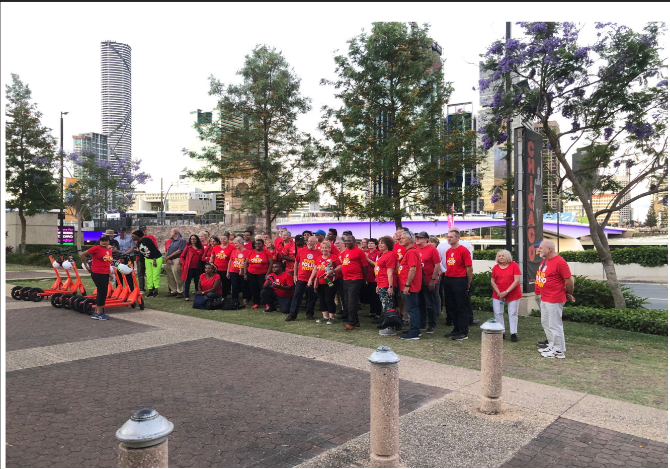
After the walk across the Victoria Bridge