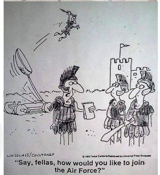
WASSGLASS/COULTHART © 1997 Famous Cartoons Distributed by Universal Press Syndicate "Say, fellas, how would you like to join the Air Force?"