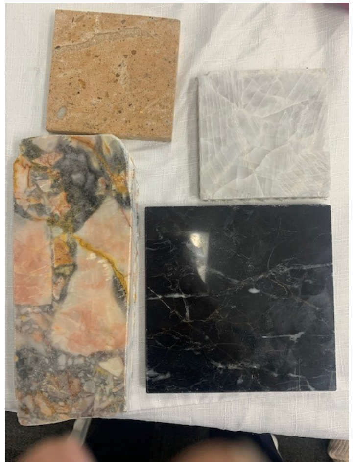
FACES WITH 3 METRE BENCHES