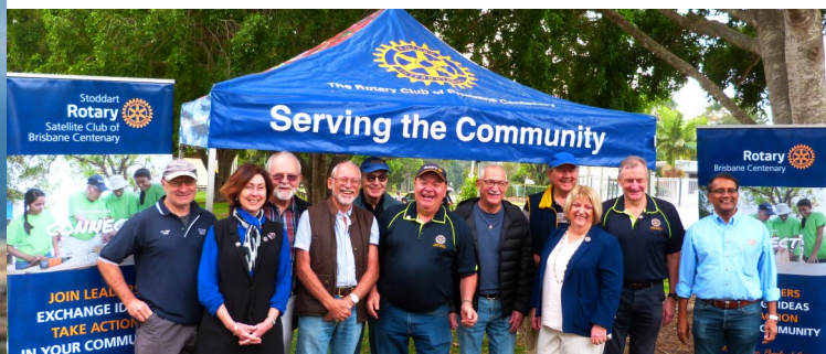
The Board for 2021 –22

President Treasurer Secretary International