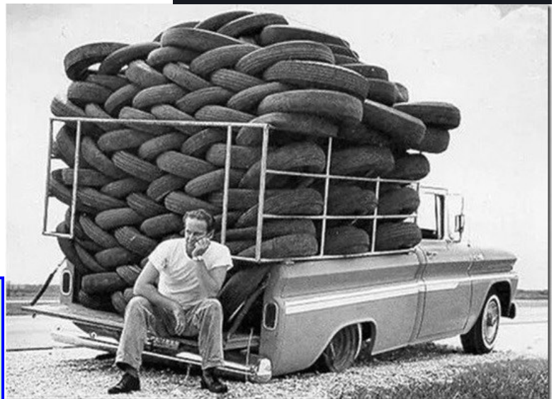
The definition of irony.