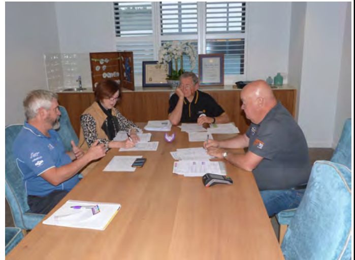
Your Board hard at work before the meeting proper!

New Generations: Di bookmarked 25 October for our breakfast meeting with the RJCA students at Jamboree Heights