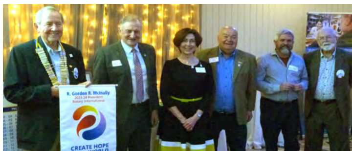
The Board for 2022 – 23